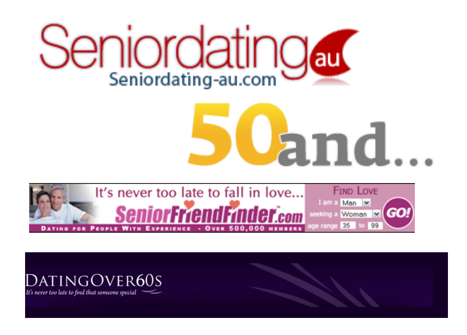
Figure 3.1 Examples of senior dating websites, 2013

Research conducted by Brym and Lenton estimated that older adults aged 60 plus comprised 1.6% of online Canadian daters (2001: 14). In addition, recent statistics supplied by RSVP.com<sup>®</sup>, an Australian online dating site, indicate that older adults (aged between 50 and 91 years) comprise 22 percent of their membership database (Fairfax Digital 2012), up from 18% in 2010 (Fairfax Digital 2010). These service provider numbers indicate that older adults are increasingly using the Internet and that they are looking for love online.